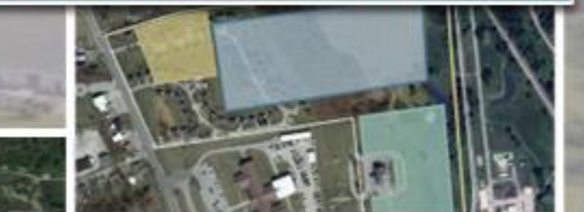
BUSINESS DEVELOPMENT PARTNERSHIPS