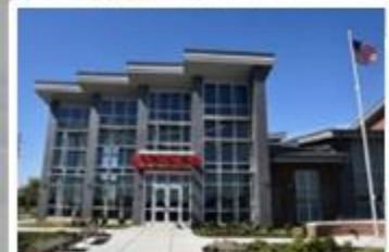
SUNSET MISSION TRANSITION